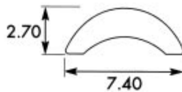
PPP 630 rubber infill fits between 30004 and 30003